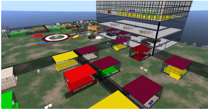
Figure 1: The VirtualSHU Virtual World