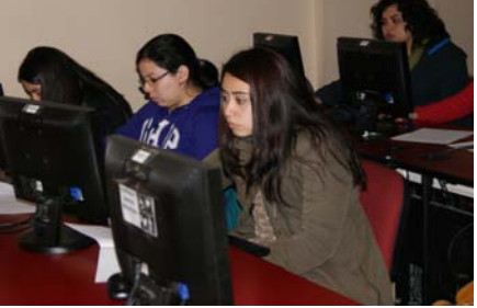
Figures 4 & 5: Workshop Second Life, Moodle and Open Sim.