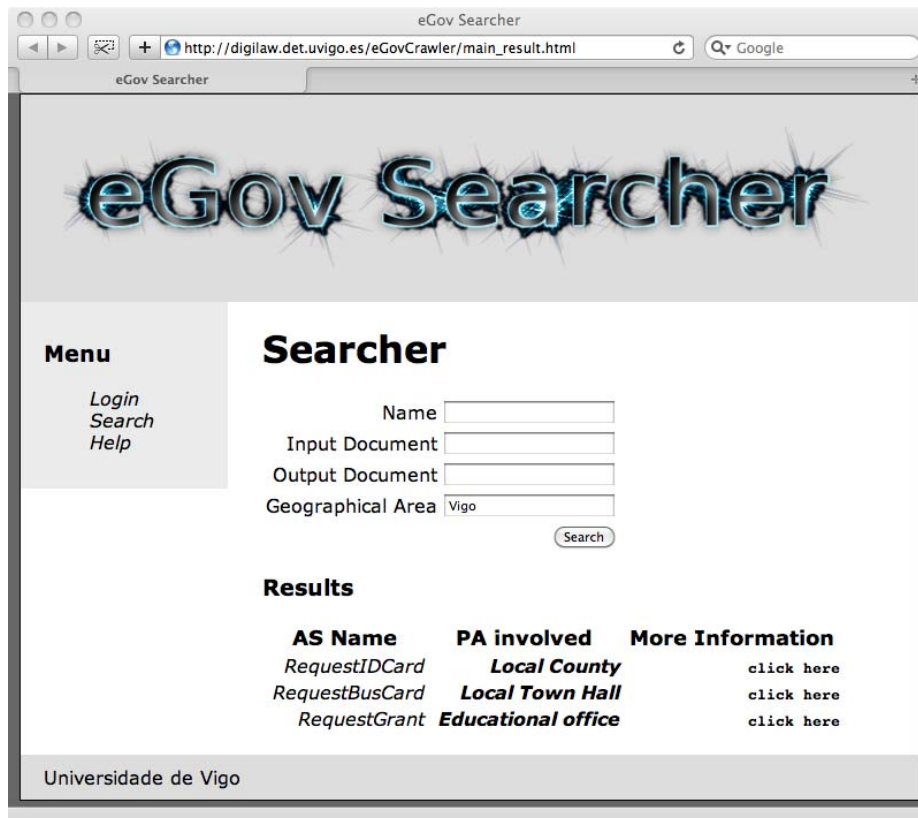
Figure 4: Web Interface for searching ASs