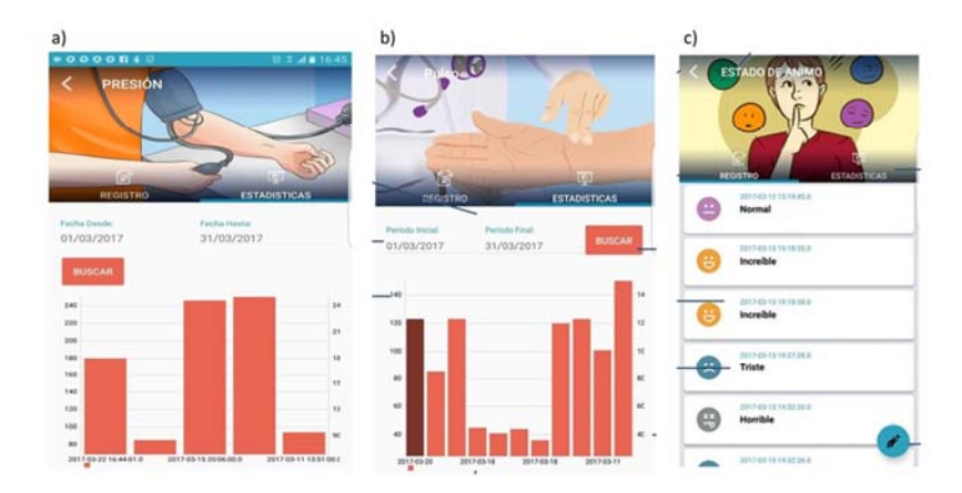
Figure 3: Interfaces for patients monitoring

The development of the asthma monitoring and control module relied on the participation of health professionals with experience in the treatment of asthma patients. One of the main contributions of this group of professionals was the establishment of symptoms and health parameters that must be monitored as part of the asthma self-management process to keep this disease under control and prevent severe asthma episodes. Some of the vital signs that are considered by the present module are the respiratory rate, heart rate, systolic blood pressure, pulse, temperature, among others. For instance, a respiratory rate greater than 30 beats per minute, a heart rate greater than 120 beats per minute, and a paradoxical pulse greater than 12 mmHg are associated with severe asthma attacks. Hence, it is necessary to know the early warning signs that happen before or at the beginning of an asthma attack.