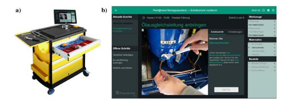
Figure 1: The Plant@Hand assembly assistant by Fraunhofer IGD: a) An assembly trolley is equipped with an assistance system [Alm et al. 2015b]. b) The display at the work station shows information supporting the current work task.