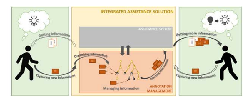
Figure 2: Concept Overview. A knowledgeable worker (left side) gets information from the system such as instructions. The worker knows more than the system and adds his comments. These get semantically enriched by topical classification that is deducted from the worker's situation. Regarding another (less knowledgeable) worker (right side) in another task the system selects and ranks topical relevant information and provides it to the worker to support him in his task and in getting more knowledgeable.

Those topics emerge to a circle of information sharing between humans. We demonstrated how the annotation activity can help to easily and intuitively insert information into the system. In the following we want to explain how we identify the relevant information.