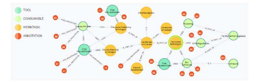
Figure 3: Part of our assembly domain ontology consisting especially of work task concepts and materials and tools. Annotations contain additional information describing the real life counter parts of those ontology concepts. The concept used in our sample calculation is circled green.

only one of their attributes. Because of this, the annotations "95" and "96" are favored even as they score badly in one aspect. Interestingly the annotation with the id "101" is even favored above annotation "85" which is nearer to the topic, but scores worse in the entirety of its attributes. This can be sensible to get recommendations of high quality annotations that score good in more than one aspect. The beforehand filtering of the annotations by their W value ensures that only topic relevant annotations are chosen as initial set. For the further sorting we consider the other contextual parameters to be equally important to find high quality annotations. If the distance to the topic is seen as much more important the method can be adapted to weight the distance more by using a