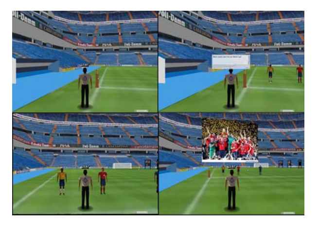
Figure 1: Deployment of the question ("Who won the last Football World Championship?")

Once all the necessary assets have been properly placed in the world, the next step in the authoring process involves the creation of a new snapshot. A snapshot is a copy of the current state of the virtual world. That copy will be used later as the setting for the delivery of the questions.