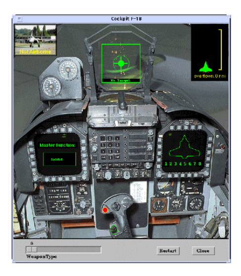
Figure 3: Customized simulator front-end for an avionics system.

language of Spin. The user can demonstrate and validate a property violation detected by Spin with the SCR simulator.